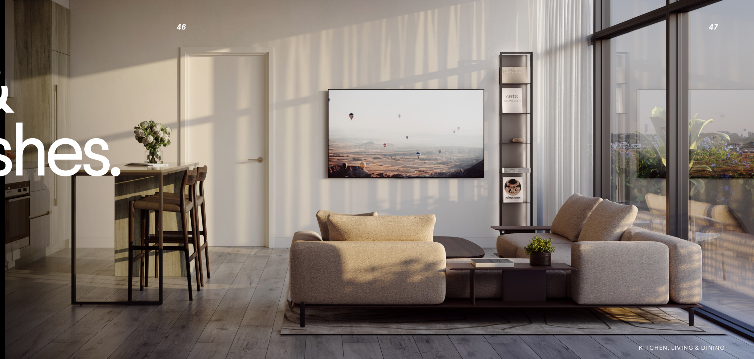
KITCHEN, LIVING & DINING

The details in every suite are given careful consideration to ensure the space is light and livable. High quality, modern finishes add function and form to your home.