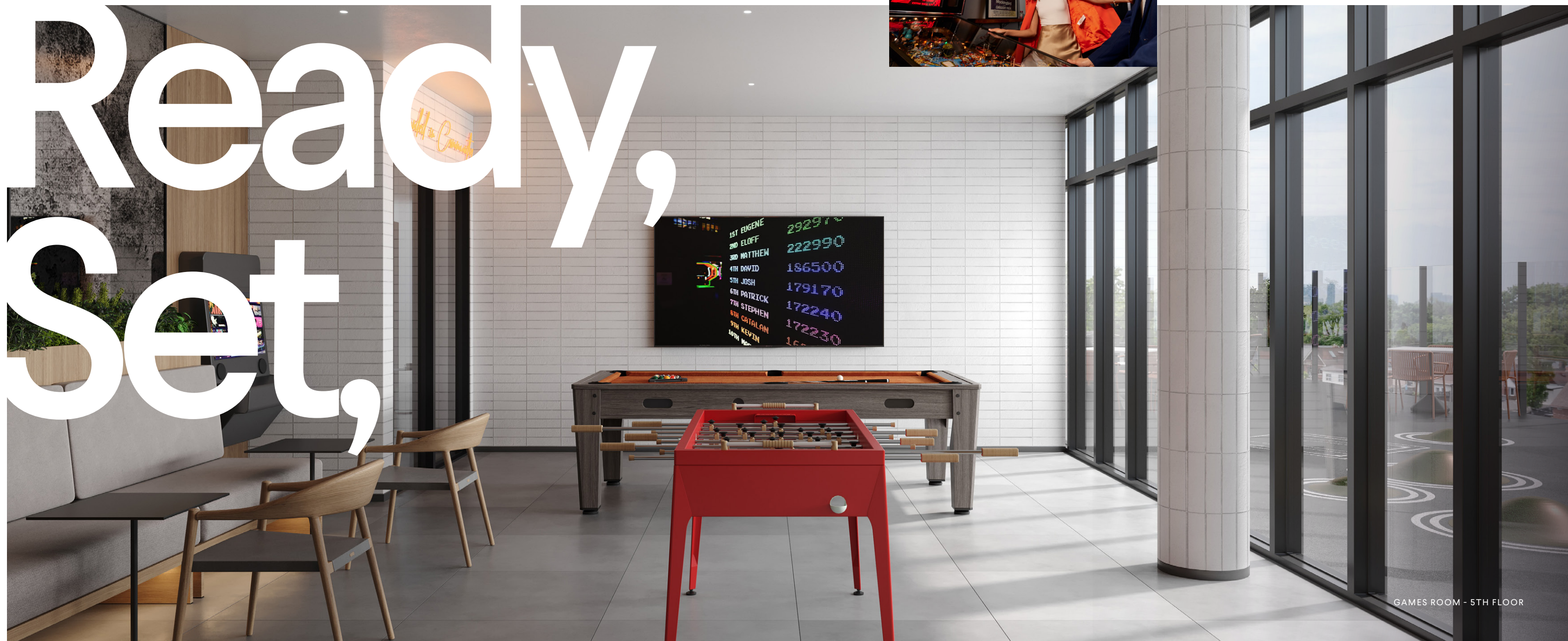
GAMES ROOM - 5TH FLOOR