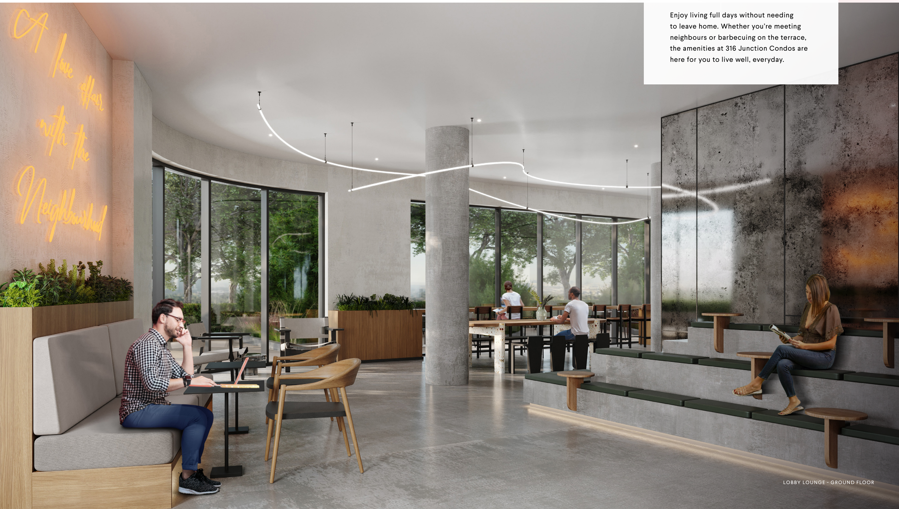
LOBBY LOUNGE - GROUND FLOOR

Enjoy living full days without needing to leave home. Whether you're meeting neighbours or barbecuing on the terrace, the amenities at 316 Junction Condos are here for you to live well, everyday.